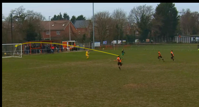
Higgs finish is sublime

The home side huffed and puffed and on other day their good link up play may have come with a reward but a mix of strong defending and poor finishing saw the visitors hold on to a well deserved win to see them overtake their hosts, into thirteenth place.