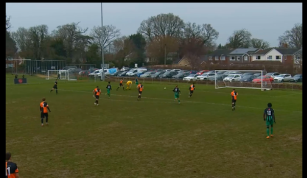
William's strokes home in the 16th minute

Following the opening goal, it was the home side that played the neater football on a difficult mid-winter pitch and with their midfield retaining well and forcing the visitors to defend some uncomfortable attacks. Several forays into the Wokingham final third saw the W&C back 5 work hard to repeal a confident home side.